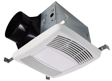
Optional Speed controller Metal Grille